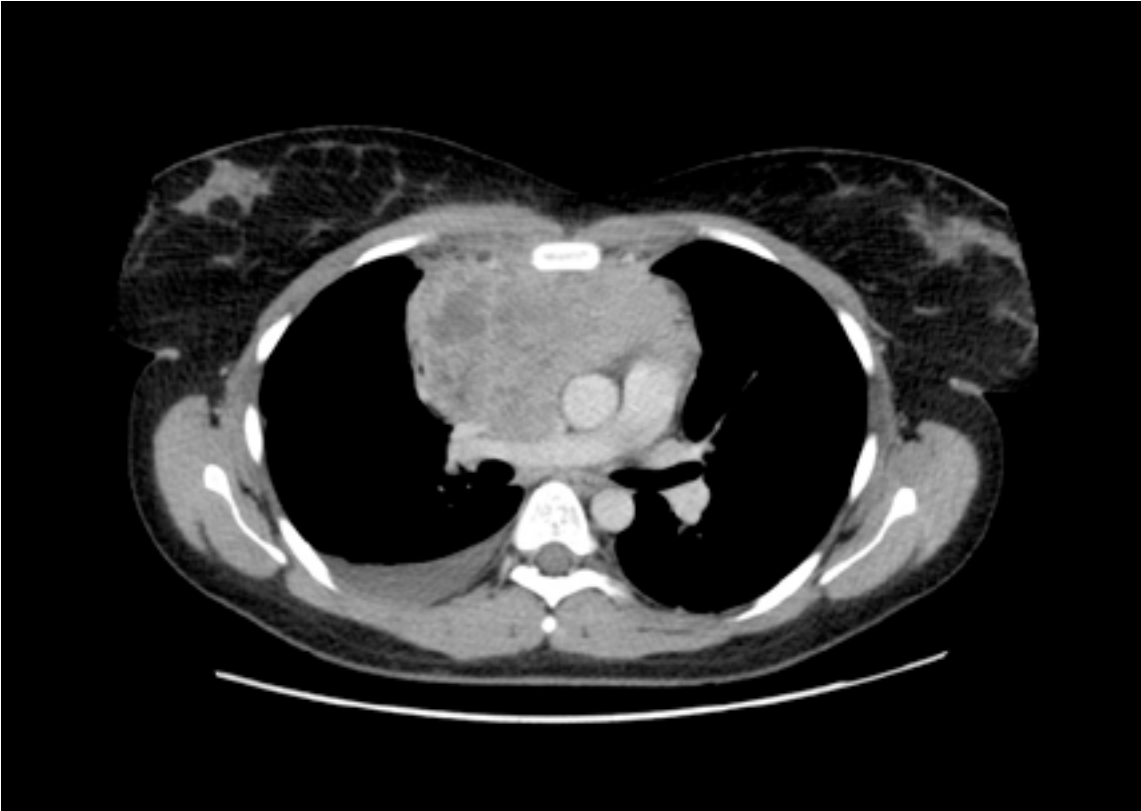
Figure 2, CT Scan of Thorax showing anterior mediastinal mass. Right sided pleural effusion also noted.